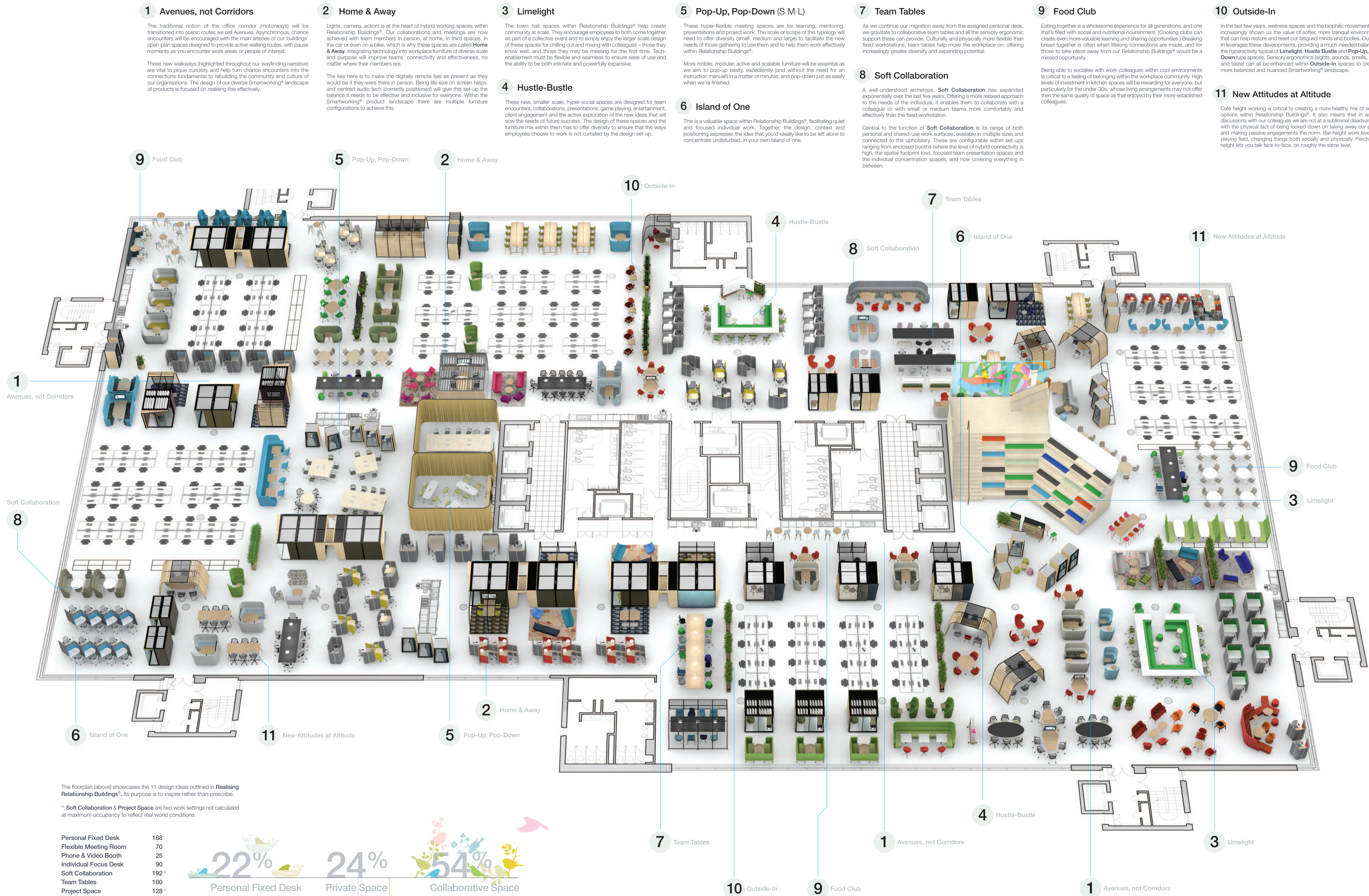
The floorplan (above) showcases the 11 design ideas outlined in Realising Relationship Buildings®, its purpose is to inspire rather than prescribe. * Soft Collaboration & Project Space are two work settings not calculated at maximum occupancy to reflect real world conditions.

Orangebox Smartworking® London 38 Northampton Road, London EC1R 0HL, United Kingdom. T: +44 (0)20 7857 9922 email: smartworkinglondon@orangebox.com Head Office & Manufacturing Orangebox Limited, Parc Nanterre, Clairfont CF15 7DU, United Kingdom. T: +44 (0)1443 816 604 email: sales@orangebox.com Orangebox Smartworking® New York 303 3rd Avenue, Suite 600, New York, NY 10011 email: nyc@orangebox.com Orangebox Smartworking® Huddersfield Barns Mill, Crane Road, Huddersfield HD1 3AG, United Kingdom. T: +44 (0)1484 536 400 email: smartworkinghuddersfield@orangebox.com Orangebox Smartworking® Dubai Dubai Design District, Building 11 Office 504, PO Box 333016, Dubai, UAE. T: +971 634770 7000 email: smartworkingdubai@orangebox.com www.orangebox.com